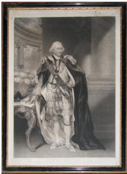
343. [Cornwallis, General] Marquis Cornwallis. Lord Lieutenant and Commander in Chief of His Majesty's Forces in the Kingdom of Ireland; Knight of the Most Noble Order of the Garter, Master General of the Ordnance, &c. &c. &c. £290