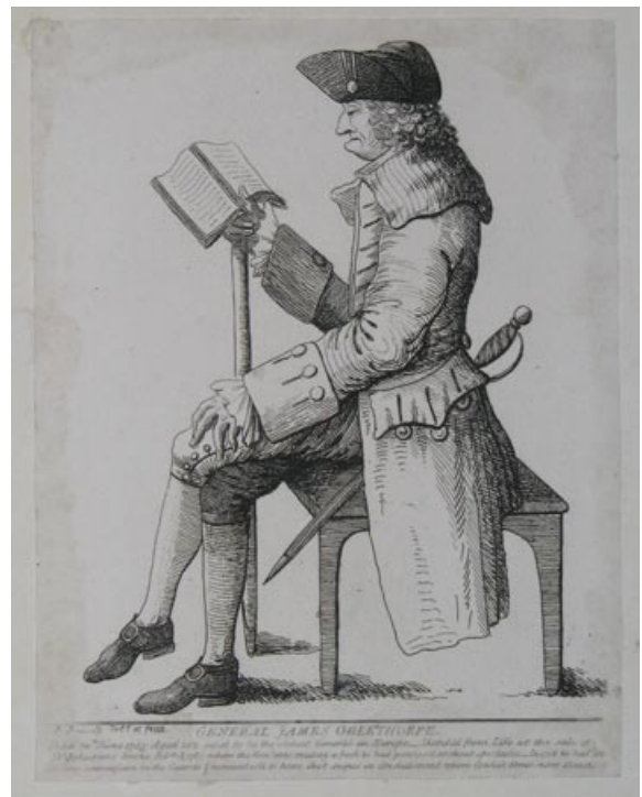
346. [Oglethorpe, James] General James Oglethorpe. Died 30th June 1785 Aged 102 said to be the oldest General in Europe__Sketch'd fom Life at the sale of Dr. Johnsons books Feby 18, 1785 where the Genl was reading a book he had purchas'd without spectacles__In 1706 he had an Ensigns commission in the Guards & remember'd to have shot snipes in Conduit mead where Conduit Street now stands. £130

S. Ireland delt. et fecit. [ Published by I. Cary 1785. ] Etching, sheet 215 x 165mm. Trimmed to plate and glued to album page. James Edward Oglethorpe (1696 - 1785), general, philanthropist, and colonist of Georgia, as sketched at Dr. Johnson's sale. In June 1732 Oglethorpe, with twenty associates, obtained a charter for settling the colony of Georgia in America, a tract lying between the rivers Savannah and Alatomaha, named in honour of George II, who gave Oglethorpe every encouragement. Oglethorpe and the other trustees, who opened an office in Old Palace Yard, Westminster, received liberal private subscriptions and a grant of 10,000l. from parliament. The settlement was designed not only as a refuge for paupers, but also as a barrier for the British colonies against aggression by Spain on their southern frontier. On grounds of military expediency, rather than of social economy, negro slavery was wholly prohibited.